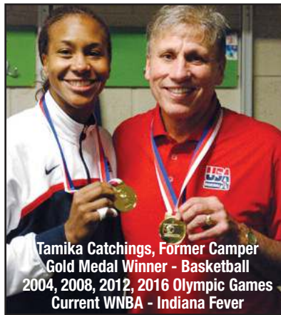
Tamika Catchings, Former Camper Gold Medal Winner - Basketball 2004, 2008, 2012, 2016 Olympic Games Current WNBA - Indiana Fever

Women's Basketball Pioneer and Crusader at all levels